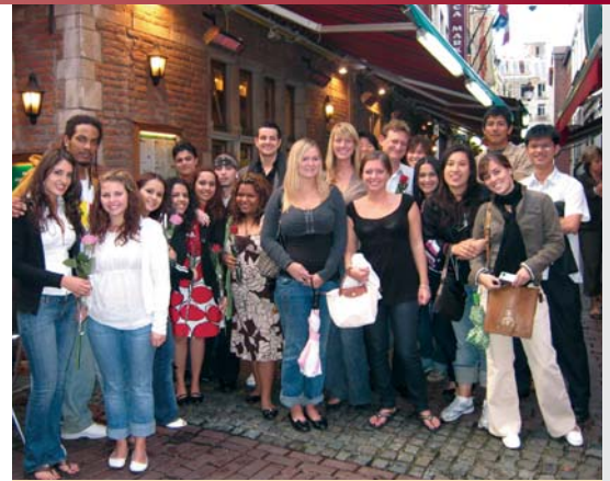
Summer students in Paris, France.