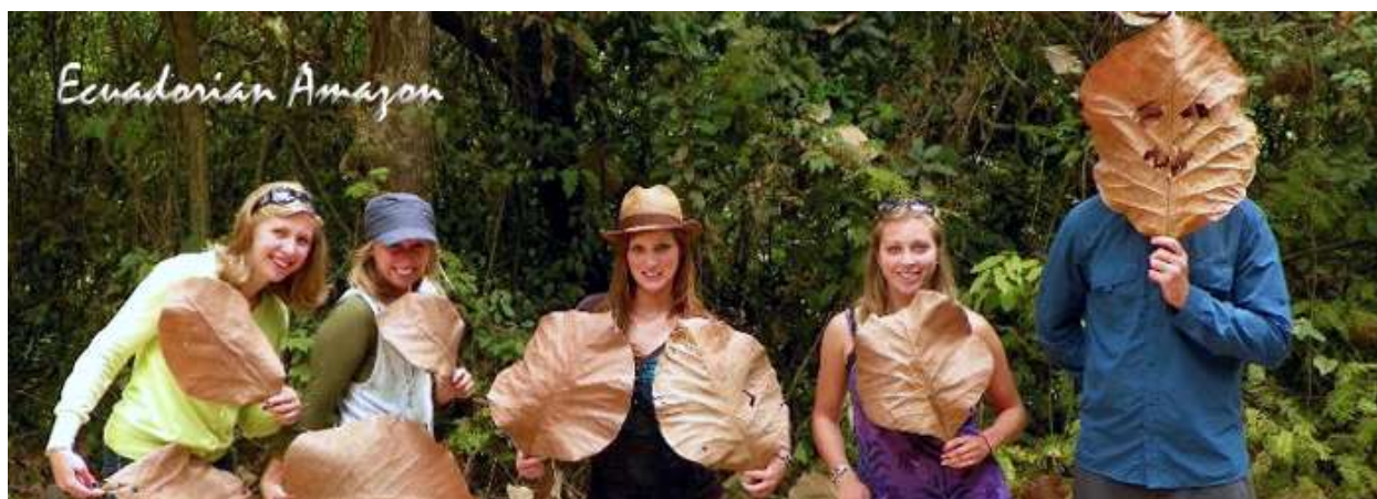
Unique group pic from the Amazon.