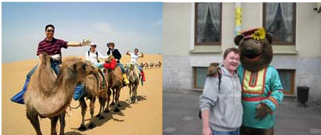
Interesting photos with a local flare.