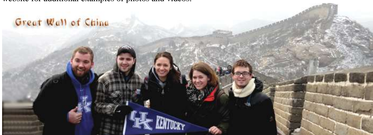
Students holding a University of Kentucky banner.

There are numerous possibilities for submissions. Below are just a few examples of photos. Visit the KEI website for additional examples of photos and videos.